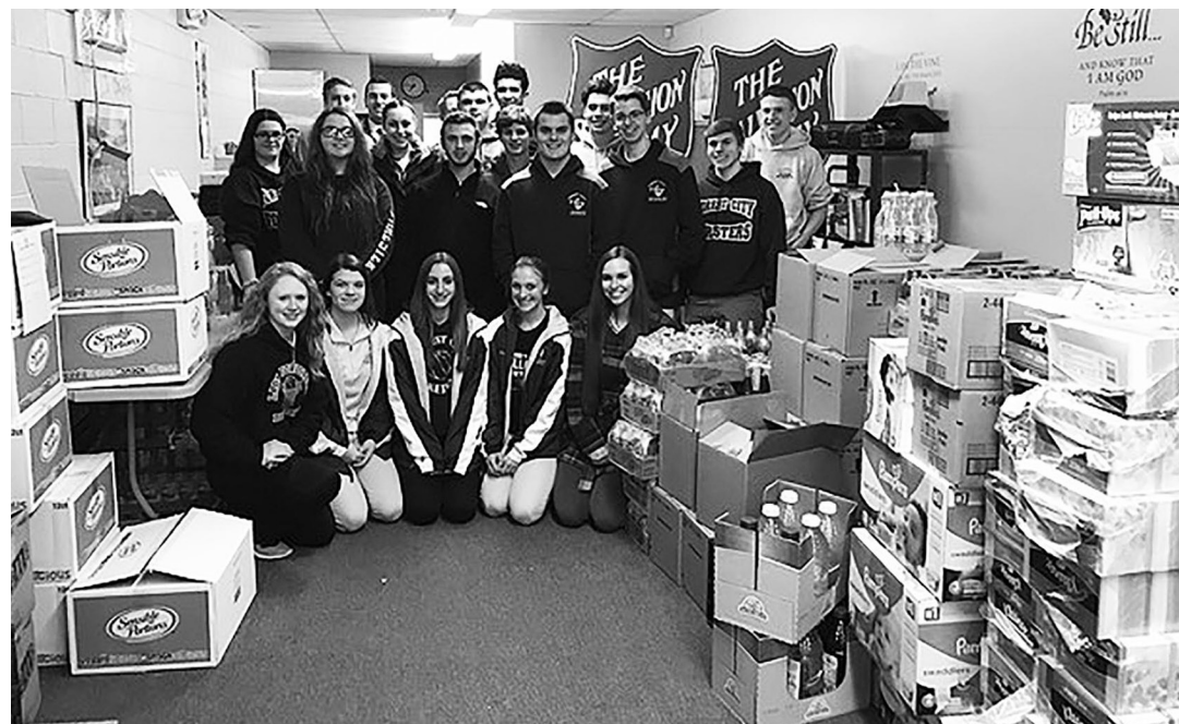
The Forest City Salvation Army, with the help of students at Forest City Regional High School, handed out food to over 200 people on Wednesday, January 25 at the location on Main Street. Food was donated by the Weinberg Food Bank, The Village of Four Seasons and the United Methodist Churches of Clifford and Lenoxville.