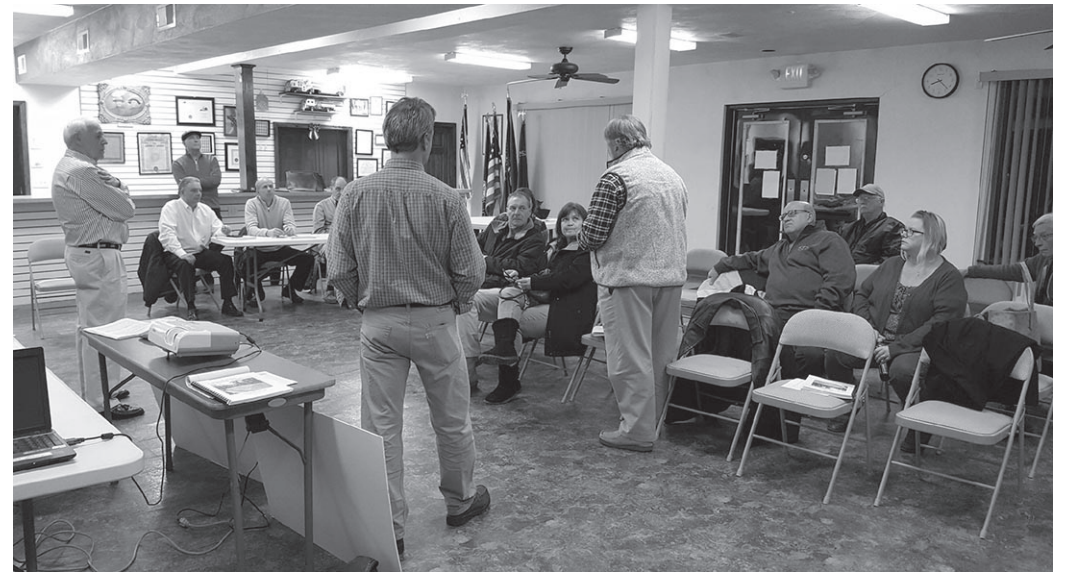
Representatives of Penna. DEP and KBA Engineering held a public information meeting for officials and residents of Forest City and Vandling on Jan. 10 at Forest City Emergency Services to discuss new regulations on storm water emissions from properties. A user fee will be imposed on property owners to fund the regulations. There were 18 in attendance.

The next meeting, all open to the public, will be Sunday, Feb. 11 at 6PM in the Museum basement.