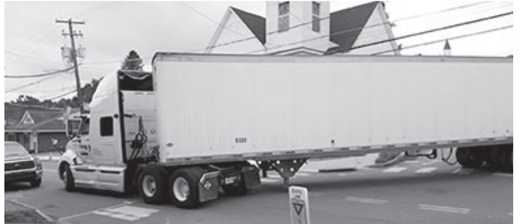
A large tractor trailer is attempting to go south on Rte. 171 (Main St.) from Dundaff St., Sept. 20. Earlier this week a triple-wide section of a home, headed for Elkview Drive, got hung up turning from Main Street west on Dundaff Street. The result included a downed parking meter and damage to the overhang on Dr. Tomazic's building at 632 Main St.