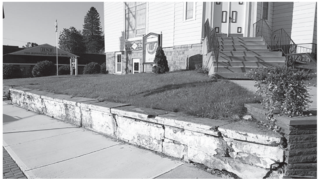
Large donations by five benefactors will make it possible for the long standing wall in front of the Forest City Area Historical Society to be replaced by another stone wall rather than being completely removed.

Students from the Student Council and FBLA, of Forest City Regional School, will again have a Haunted House for Halloween in Forest City, at the Spano building across from First National Bank on Main St. on Thursday, Oct. 25 from 6-9 PM and Friday, Oct. 26 from 6:30-9:30 PM.