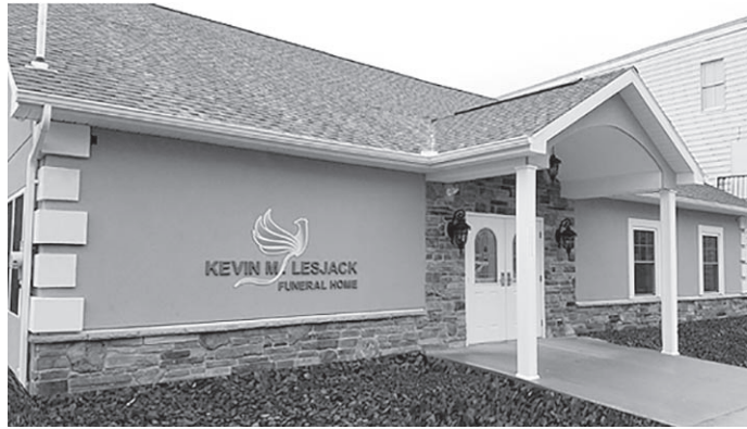
Shown is the front of the new Kevin M. Lesjack Funeral Home. The open house is set for Sunday, January 27th from 1 PM to 4 PM.