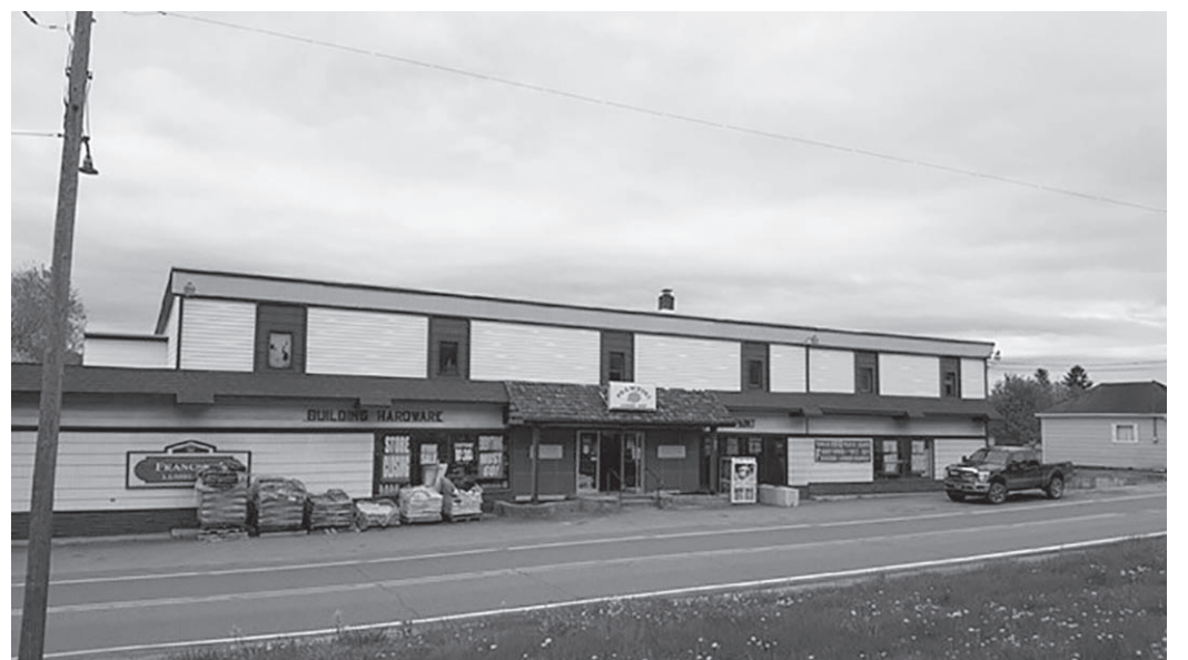
After 105 years, Franceski Lumber Co. will close its doors following a liquidation sale which is underway at the present time.

The event will be held on Thursday, May 16, 2019 from 5:00 p.m. to 7:00 p.m. at 507 Main Street, Forest City in the parking area next to the "Coal". Look for the tents.