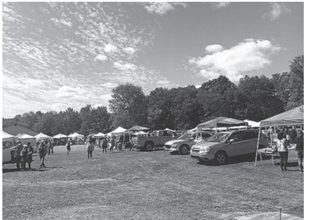
Almost 80 vendors were on hand as the Kennedy Parks and Recreation held their second to last vendor market of the year on Sunday, September 20. The weather has been great at every one of the vendor markets that has been held this Summer. Cars were parked on the sides of the road leading up to the park as well as parking areas in the Park. The next vendor market will be held on October 18 from 10 AM to 4 PM.